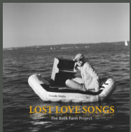
Lost Love Songs (The Balik Farm Project) (2014)