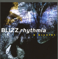
A Bientôt (2005)