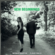
New Beginnings (2013)