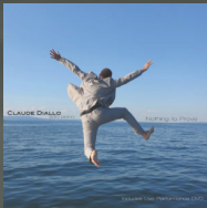
Nothing to Prove (2013)