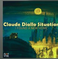
I Found A New Home (Vinyl) (2020)