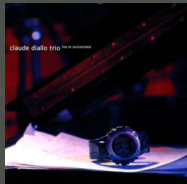
Live in Switzerland (2006)