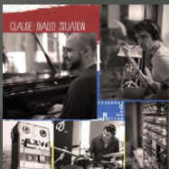
Motion in Progress (2013)