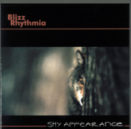
Shy Appearance (2001)