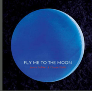
Fly Me to the Moon (2015)