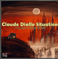
I Found A New Home (2020)