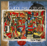
Now Then (2010)