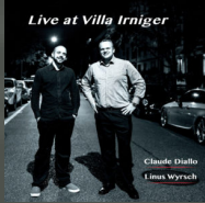
Live at Villa Irniger (2016)