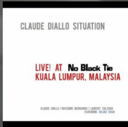
Live at No Black Tie: Kuala Lumpur, Malaysia (2011)